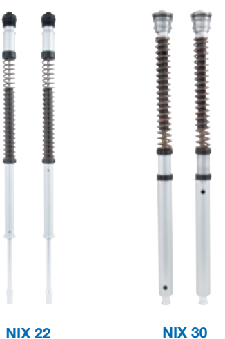
NIX 22 NIX 30 CARTRIDGE KIT CARTRIDGE KIT