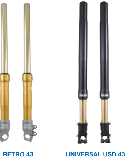
UNIVERSAL USD 43 FRONT FORK