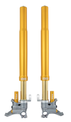
FGR 300 FRONT FORK