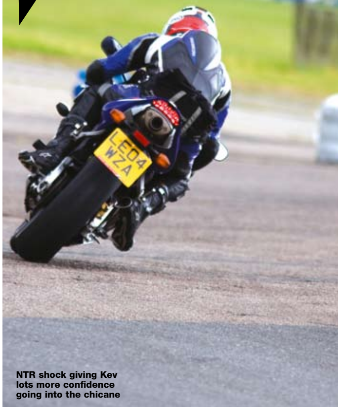
NTR shock giving Kev lots more confidence going into the chicane