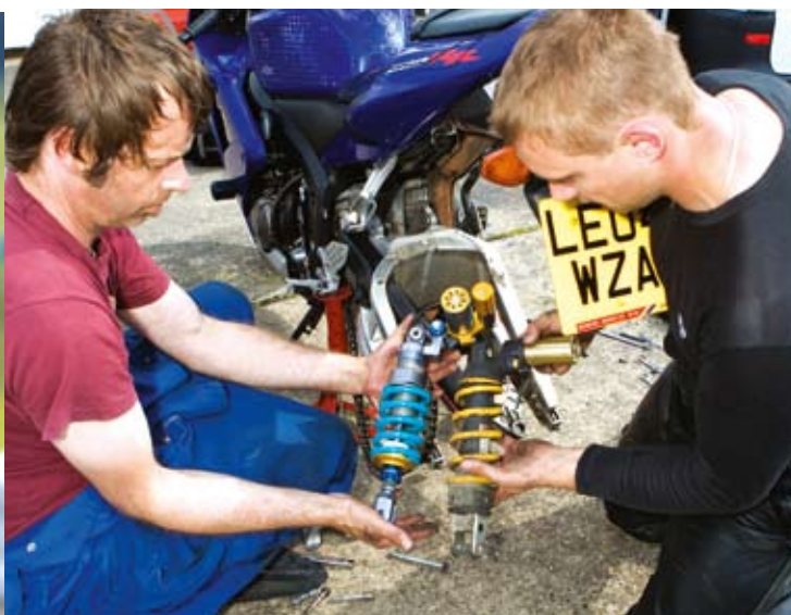
Above: Al and Ben make a shock change look easy. Sort of Right: Lightweight, CNC machined, aircraft alloy shock with third piston shim stack for very low rebound control